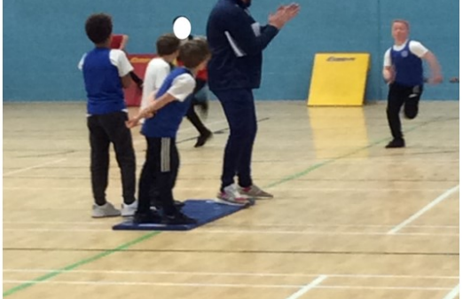
Click below to see what has been happening in your child's class this week: